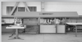
K2i Joinery Machine