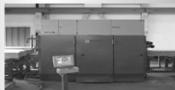
HM4-Four Sided Planer