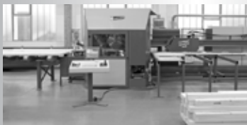
SC2i Whole House Saw