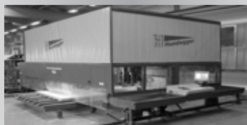
PBA-Panel Cutting Machine