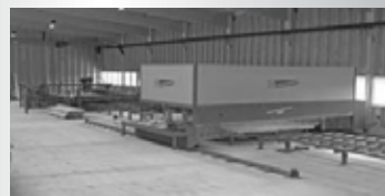
MHM Solid Wood Wall Production Line

Visit us at www.hundeggerusa.com . For more information email us at info@hundeggerusa.com , or call (435) 654-3028.