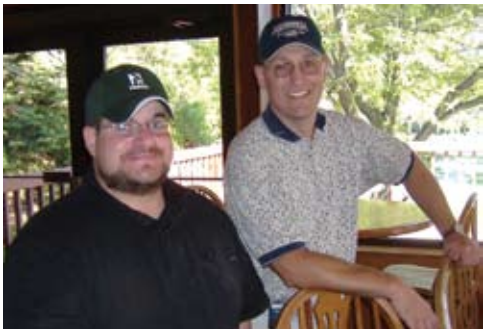
Wisconsin Chapter members enjoyed a great day on the greens and over drinks.