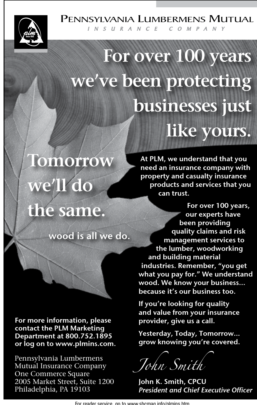
For reader service, go to www.sbcmag.info/plmins.htm

For reader service, go to www.sbcmag.info/panelsplus.htm