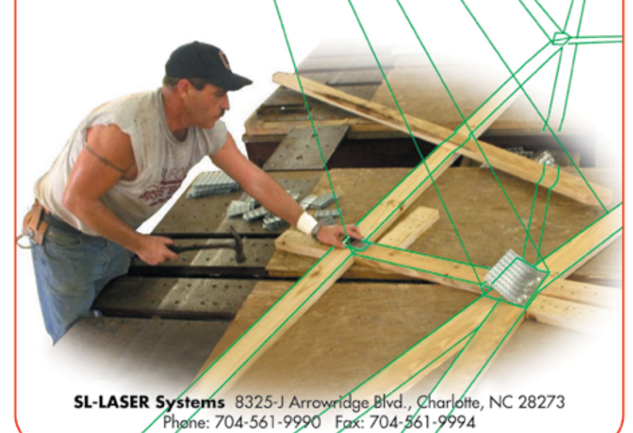
For reader service, go to www.sbcmag.info/sl-laser.htm

See immediate gains in profit-producing performance www.sl-laser.com