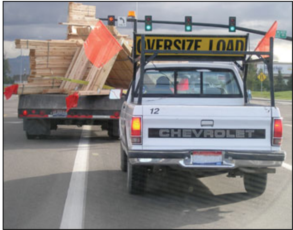
REQUIREMENTS FOR ESCORT VEHICLES VARY BY STATE. IN GENERAL, MOST PERMITS AT THE TIME OF ISSUANCE WILL INDICATE IF, AND HOW MANY, ESCORT VEHICLES ARE REQUIRED FOR THAT PARTICULAR LOAD.

addition, the FHWA established a bridge exception formula in 1975 to reduce the risk of possible damage to expensive highway bridges. Again, in general you will most likely not have to worry about this formula given the nature of the product you transport. However, in instances where you may be approaching overall vehicle weight limits, the bridge exception formula prompts equal