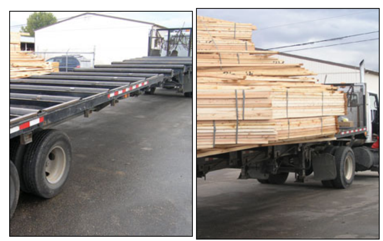
MOST STATES HAVE SET THEIR ALLOWABLE TRAILER LENGTH LIMIT AT 48'. SINCE THE TYPICAL ROLL-OFF TRAILER STARTS AT 42', IF YOU FIND YOURSELF EXPANDING IT BEYOND SIX FEET TO ACCOMMODATE YOUR LOAD, YOU WILL LIKELY NEED AN APPROPRIATE STATE PERMIT.

The FHWA sets size and weight limits allowable for commercial transport, which includes non-reducible oversize load requirements, whereas the NMCSA approves rules that pertain to cargo securement. This article will address those issues pertaining to the FHWA, including vehicle weight and size limits, and subsequent state agencies with jurisdiction