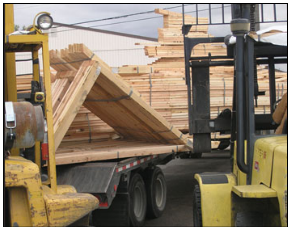
STACKING DIFFERENT SIZED AND SHAPED TRUSSES, EITHER ON TOP OF EACH OTHER OR ARRANGED ON THE BED OF THE TRAILER, IS ALLOWED UNDER NON-REDUCIBLE OVERSIZE PERMITS, AS LONG AS THE STACKING DOES NOT CONTRIBUTE TO THE OVERSIZE INFRACTION.