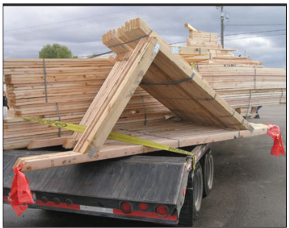
IN THE CASE OF OVERHANGS, EITHER OR THE FRONT, REAR OR SIDE OF THE VEHICLE, MOST STATES REQUIRE PLACEMENT OF FLAGGING AND OTHER CAUTIONARY SIGNAGE ON THE OUTERMOST EDGE OF THE MATERIAL.

Maximum federal weight limits are 20,000 lbs per vehicle axle, with a gross vehicle weight limit of 80,000 lbs. In