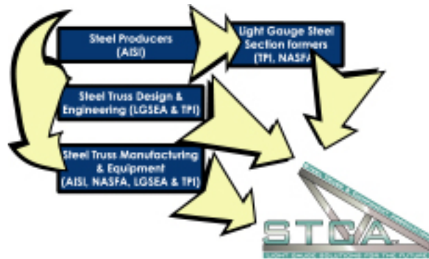
FIGURE 3 CLICK ON IMAGE FOR LARGER VIEW