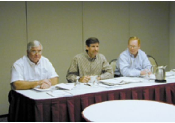
BCMC 2000 Committee Meeting in Milwaukee, WI